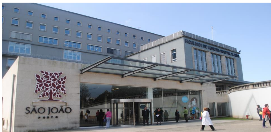
São João Hospital