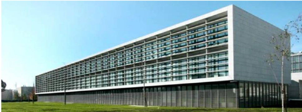
CIM (Medical Investigation Center)

Facilities of the Medical Investigation Center (CIM) of the Faculty of Medicine University of Porto and the São João Medical Center.